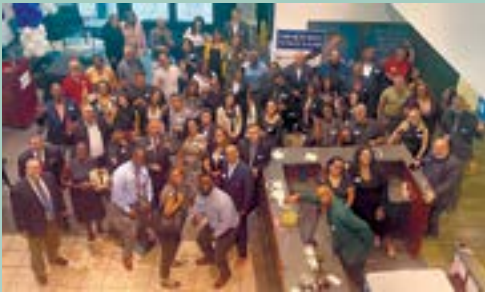
The NJFCU Business Mixer was a huge success!

During the Keys to Homebuying workshop, partners extended their knowledge and received points toward HUD certification. This allowed members to apply for added federal assistance when purchasing a home. Police investigators led the Fraud and Scam awareness workshop. At the Mexican consulate, we helped naturalized citizens and immigrants establish