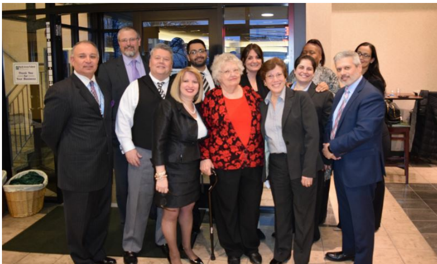
(All smiles from the staff!)