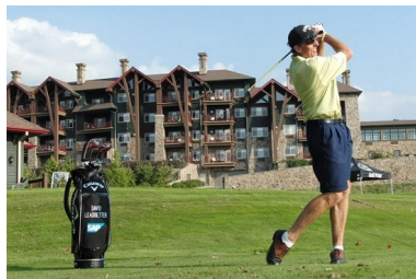
(Relaxation at Crystal Springs Resort)

This year's proceeds will be distributed amongst academic college scholarships to students in need within our community.