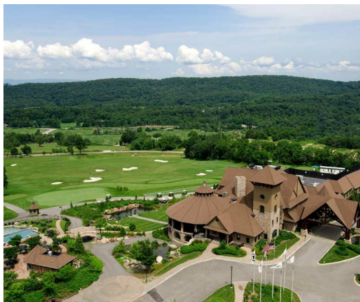
(Overhead view of Crystal Springs Resort)