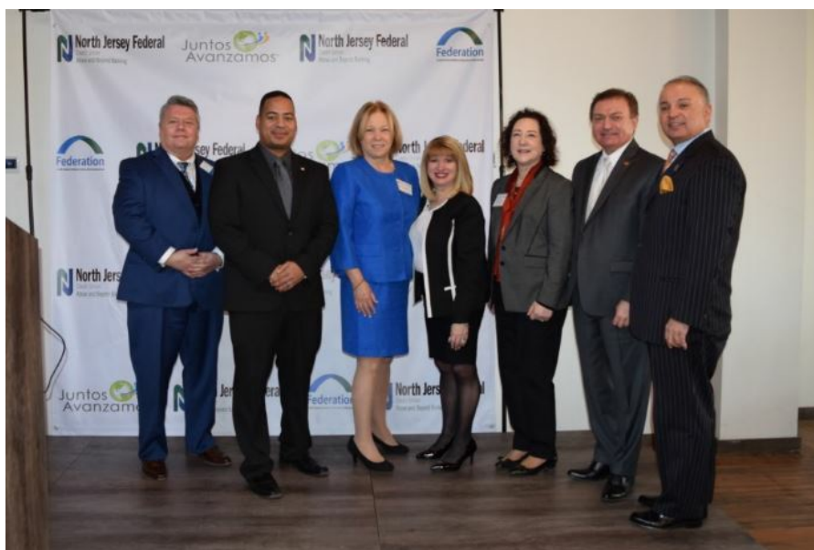
(Community leaders join North Jersey FCU executives to help grow the community)