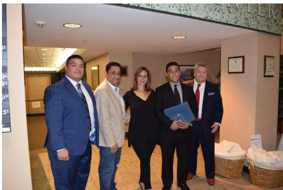
(Rodriguez Family: Owners of Starlite Window Co.)